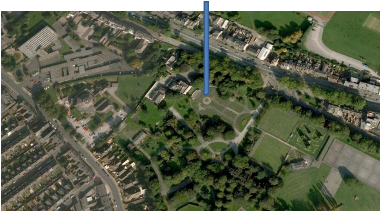
Fig. 1 - Google Earth image of the site and surrounding environs