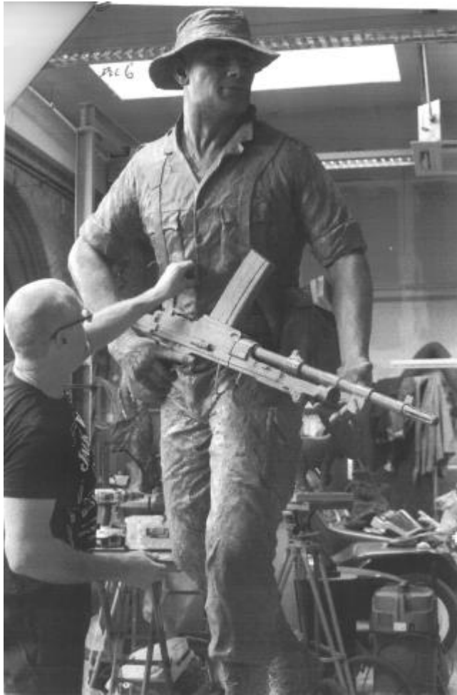
Fig. 2 – A wax model of the proposed statue to be sited